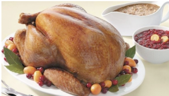
The National Turkey Federation's How To Guide for Thanksgiving on WWW.EATTURKEY.COM demonstrates how to prepare a whole turkey.

Print Email Share Comments Recommend 181 Text Size