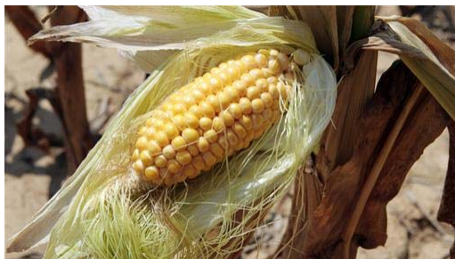
Corn Prices and your grocery bill

In late 2007 and early 2008, riots in protest to the high prices for food staples emerged in many countries, including Haiti, Egypt, Bangladesh, Burkina Faso and Morocco.